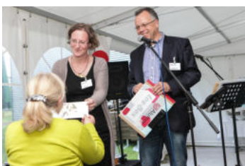
© Alumni der Universität Bremen e.V.