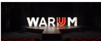
© GfG / Gruppe für Gestaltung GmbH