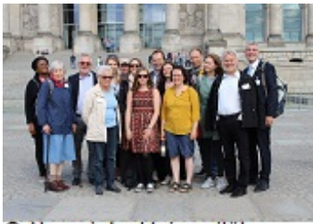
© Alumni der Universität Bremen e.V.