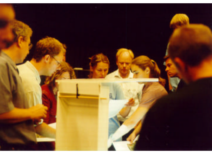
The participants starting with the role-play on the PitA-Board, reading persona descriptions and during interaction