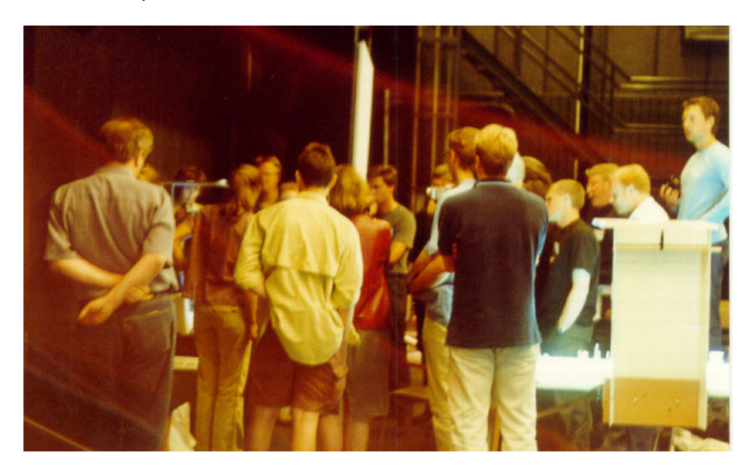
The participants during hands-on experiences

The workshop started with a short introduction, explaining the aim and program of the workshop and giving some background of the three organisers. After this a longer time slot was allocated to an introductory round for the participants. We asked people to tell their names, to explain their connection to and/or research experience with tangible interfaces, and to tell the group what they hoped to take home from this workshop, any existing questions and hypothesis concerning tangible interfaces, and what they believe to be design issues.